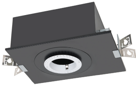
Round New Construction